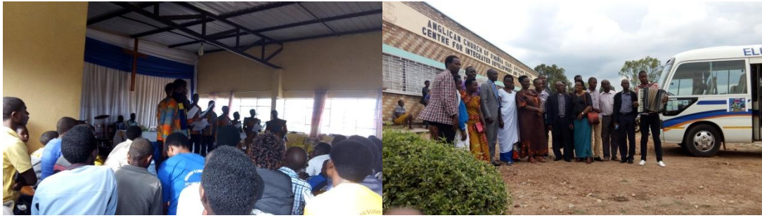
Students and staff from Ruhija School of Music (Tanzania) during their visit at Shyogwe Diocese

Due to good collaboration with police, G.S. Nyamagana got back their computers, which were stolen.