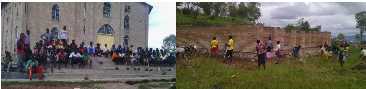
Youth at Gitarama parish

During this Easter holidays youth in Gitarama Parish were mobilized to clean the house of Pastor which is under construction.