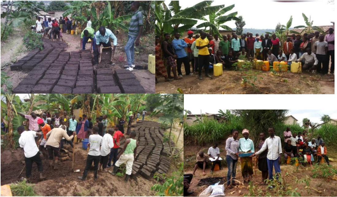
Youth making bricks at Musamo

Our God has already given us everything pertaining to life and godliness, including the principles and models of ministry in the Scriptures. As the world changes with unprecedented speed, young people are proving to be invaluable partners who can advance meaningful solutions. Hence the university students together with youth of Hanika archdeaconry helped a genocide survivor woman at Musamo local church by making bricks because she had a great need of a new house. They also gave her rice, soap, clothes and a goat.