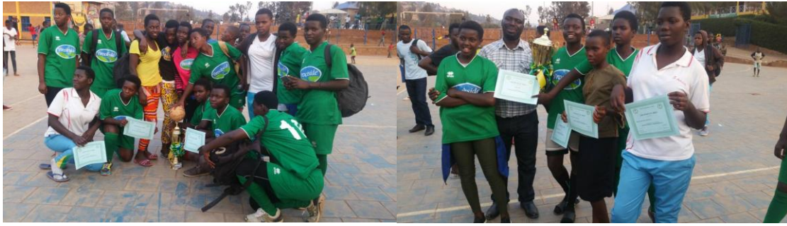
Hanika Technical Secondary School girls team is the champion