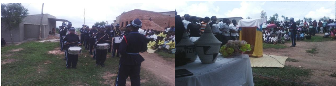
The pictures above show a group of boys and girls brigade from Kibungo Diocese in Butansinda Parish.

Youth ministry helps the church focus on the way of Jesus, which goes beyond tradition, dogma, and work and stay relevant to every body .