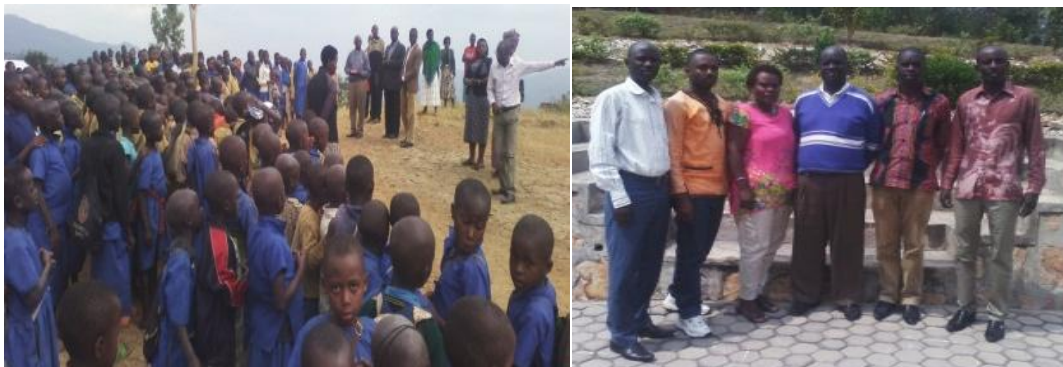
Diocesan Commission of Education visting GS Shaki and GS Nyabinoni

The Diocesan Commission of Education, Pastors and Archdeacons we visited 4 schools namely G.S. Shaki, GS Murehe, GS Nyabinoni Gishari Primary school. We controlled the use of new curriculum and pedagogical materials, hygiene among others. In addition, due to above visits we worked hand in hand with the both teaching and administration staff as well as pupils to oversee schools' management, teaching realities among other things.