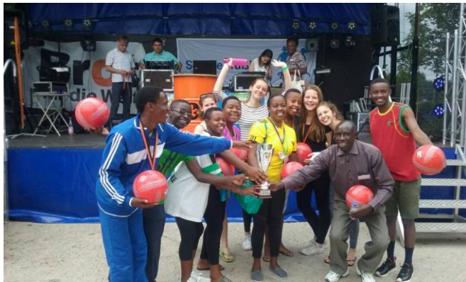
A delegation of People from Shyogwe Diocese in G.S Shyogwe who Germany

A delegation of People from Shyogwe Diocese in G.S Shyogwe 7 students, 2 teachers and head teacher visited Maria Montessori School in Germany, this partnership visit was organized by Partners in Düsseldorf together with Anglican Church in Rwanda Shyogwe Diocese towards celebration of 500 year of reformation.