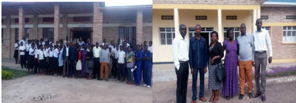
The students welcoming a new director of Vunga Training Center

A major role of education is to equip people with knowledge, skills and poise to make a difference in the transformation of society. In addition, education helps instill values, attitudes and behaviors that align with those expected in a society. Hence, we worked hard to make sure diocesan schools were well managed, and that educators are providing relevant skills. From that point of our view diocese recruited new director of Vunga Training Center, Due to the fact that the former Director passed exam to the position of executive secretary of Sector in Ruhango District.