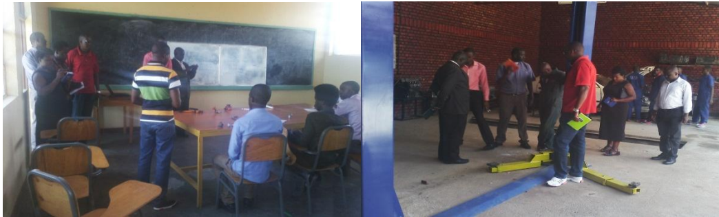
Education commission visiting AIP students during class work and mechanical workshop

We also visited Hanina AIP and shared with them the strategies on what to be done in order to increase the number of students and resolving the challenges there are facing;