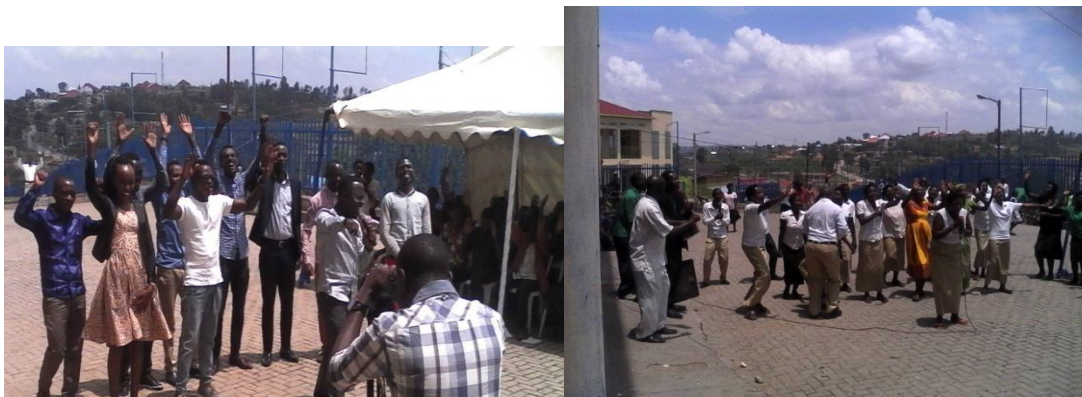
Evangelical convention in Nyamagana parish

In this year also Hanika Archdeaconry organized an Evangelical convention in different parishes and the farfetched change is happening in the church because of people who got saved. The gatherings were attended by a good number of young peoples, among them 34 accepted Jesus Christ as their personal Lord and Savior for the first time, the 172 who were backsliding were strengthened and decided to come back to Jesus Christ.